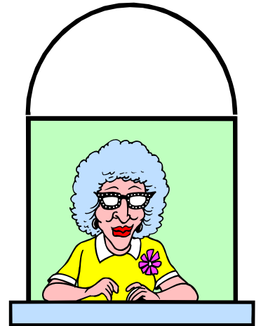
Esther's Hourly Raffle Ticket Sales